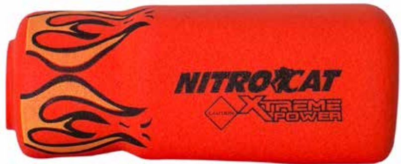
1355-XLBR Red Flame NITROCAT® Boot Fits Models: 1355-XL and 1375-XL