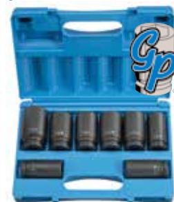
Model #1777-X 3/4-in. Impact Wrench Kit

Includes: 1777 Impact Wrench, Aircat Tool Bag and 3/4-in. Drive "Deep Length" Impact Socket Set Socket Sizes: 1" 1-1/16", 1-1/8", 1-1/4", 1-5/16", 1-3/8", 1-7/6" and 1-1/2"