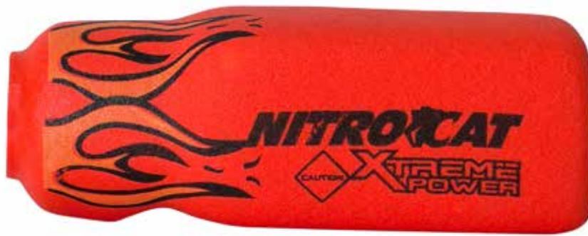
1200-KBR Red Flame NITROCAT® Boot Fits Models: 1200-K and 1250-K