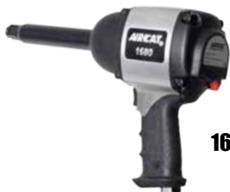
1680-6 6" Extended Anvil