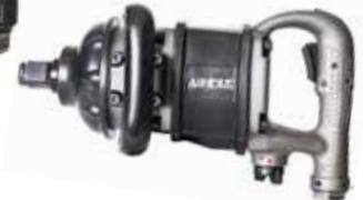
1900-A-1 Short anvil available