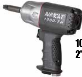
1000-TH-2 2" Ext. Anvil