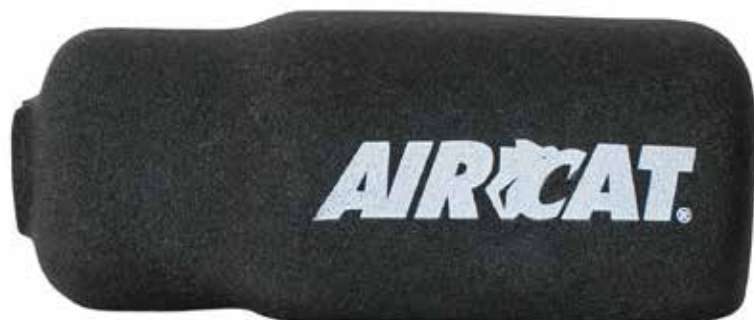
1300-THBB Black Aircat® Boot Fits Model: 1300-TH