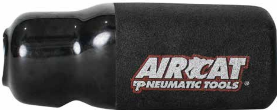
1150-BB Sleek Black Aircat® Boot Fits Models: 1150, 1000, 1000-TH and 1000-TH-2