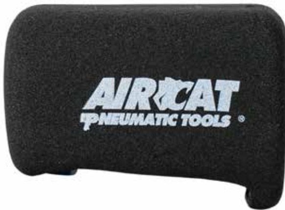
1055-BB Black Aircat® Boot Fits Models: 1055-TH and 1076-TH