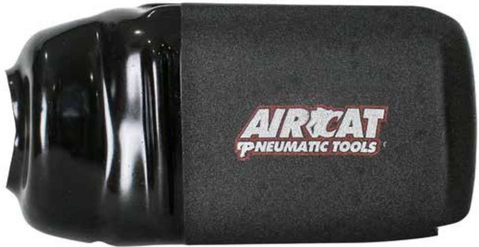
1600-THBB Sleek Black Aircat® Boot Fits Models: 1600-TH, 1600-TH-A and 1770-XL