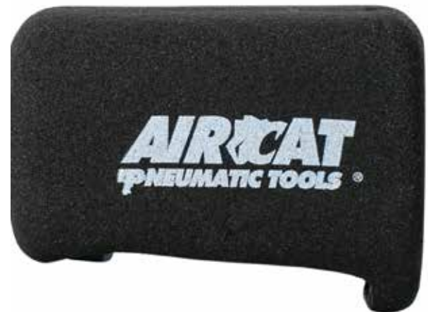
1056-BB Black Aircat® Boot Fits Models: 1056-XL and 1076-XL