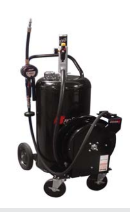
24 Gallon Package 1111-021