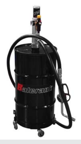
16 Gal. Drum Package - Dolly 1111-013

Bare 1:1 Pump: or 1110-009 Bare 2:1 SS Pump: 1160-009 Bung Adapter 4411-021 Air Hose (5' x 3/8") 8132-005 Fluid Hose (5' x 3/4") 8261-005