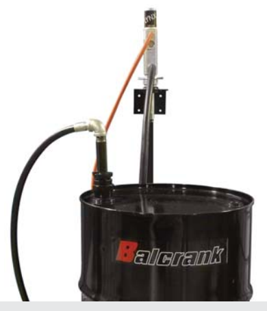
Pump & Wall Mount Package - Stub 1111-016