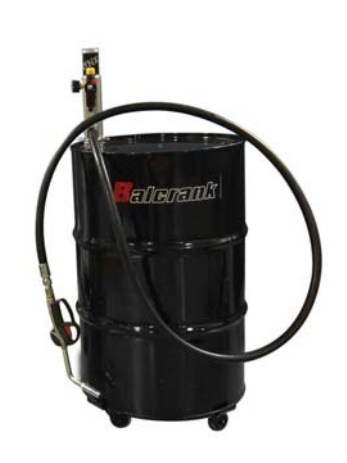
55 Gal. Drum Package - Dolly 1111-012