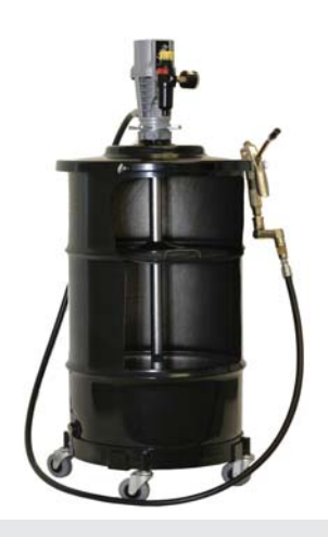
Portable Pump Packages - 120 lb. 1151-028