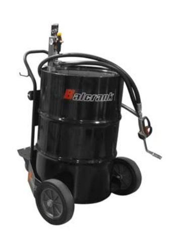
55 Gal. Drum Package - Cart 1111-014