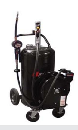
24 Gallon Package 1111-024