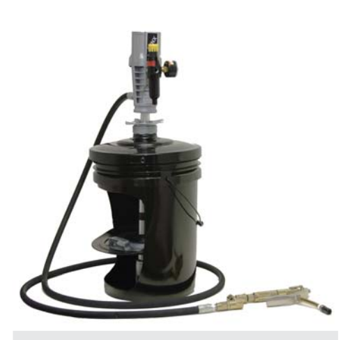
Portable Pump Packages - 25-35 lb. 1151-027