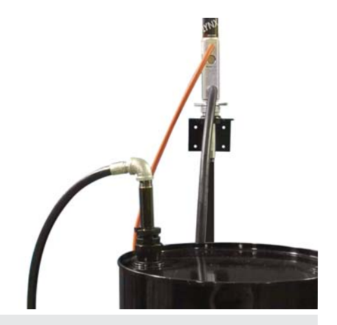
Pump & Wall Mount Package - Stub 1111-018

Bare Pump: 1110-011 4411-022 Bung Adapter Air Hose (5' x 3/8") 8132-005 Fluid Hose (5' x 3/4") 8261-005